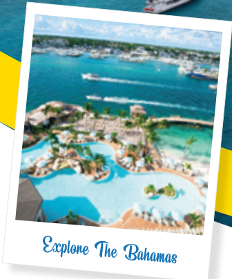
Explore The Bahamas