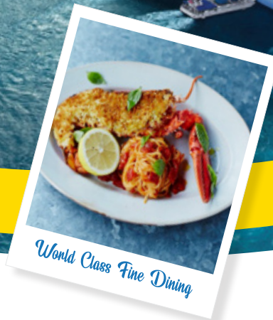
World Class Fine Dining